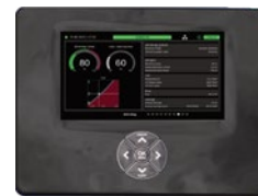
7-inch TFT display