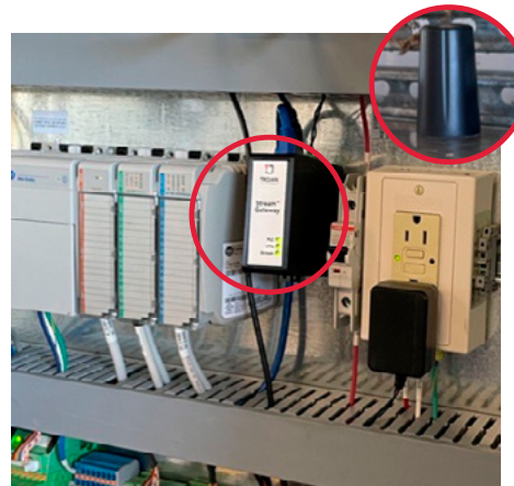
The hardware circled in red is all that's required.