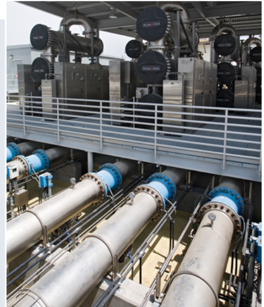
Figure 1 The TrojanUVPhox at the GWRS.

The performance of the TrojanUVPhox has exceeded the California Division of Drinking Water treatment requirements. As illustrated in Figure 2 , the system effectively reduces NDMA to below the 10 ppt treatment notification level established by the DDW.