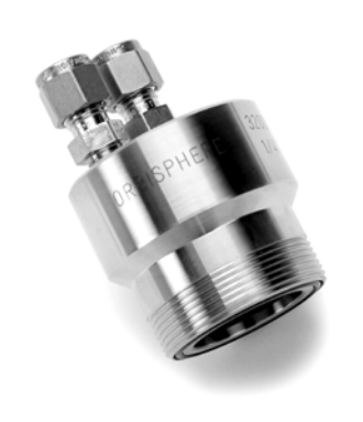
Orbisphere Flow Chamber (32001)