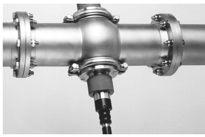
Varinline® in-line access unit with either Stationary Housing (33095) or Insertion/Extraction Valve (32003)

Sample taken from the production line and fed through a flow chamber with sensor installed. Sample conditions can be precisely controlled to ensure stable readings.