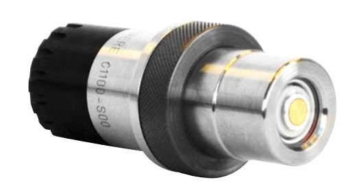
C1100 Ozone Sensor