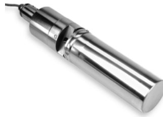
Figure 5: Nitratax sc Nitrate Sensor