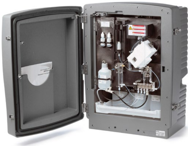
Figure 4: Hach Amtax sc Ammonium Analyser