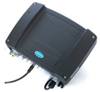
Figure 6: SC1000 Controller Probe Module