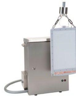
Figure 7: Filtrax (eco) Sample Filtration System

The analysis report below shows the Claros RTC-C/N/P software's impact of improved dosing. Note the reduction in undesirable COD and TN peaks in the outlet.