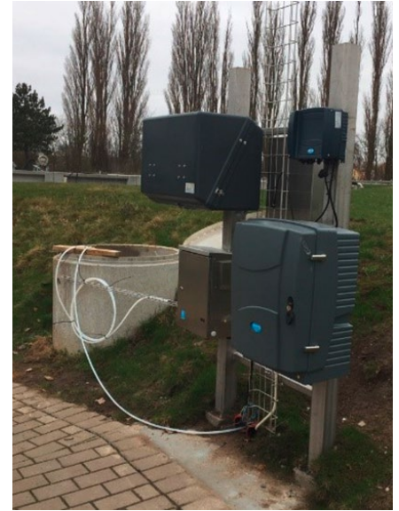
Figure 2: Hach Amtax sc Ammonium Analyser, Nitratax sc Nitrate Sensor, and SC1000 Controller Probe Module.

This manual dosing issue was the situation for Harboes Bryggeri A/S, which was looking for a solution to reduce manual laboratory analysis, automate N dosing, and improve outlet compliance.