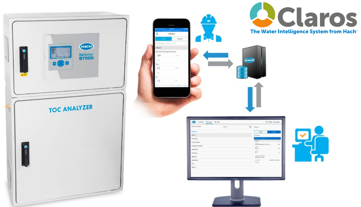
Figure 3: The Hach BioTector B7000i TOC Analyser pairs with Claros RTC-C/N/P software for feed-forward nutrient dosing control.