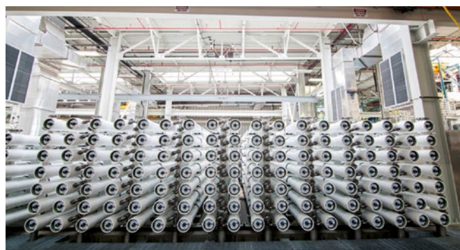
Orange County Water District Potable Water Reuse Facility (Fountain Valley, CA)

Orange County Water District's Groundwater Replenishment System (GWRS) is the largest indirect potable reuse facility in the world, producing 100 million gallons per day of highly purified water to replenish groundwater (which is the region's primary drinking water supply) and to maintain a local underground seawater intrusion barrier. The GWRS Advanced Water Purification Facility utilises a multiple-barrier approach to recycle secondary-treated wastewater through treatment by microfiltration (MF), reverse osmosis (RO), and ultraviolet disinfection with hydrogen peroxide addition (UV/H 2 O 2 )