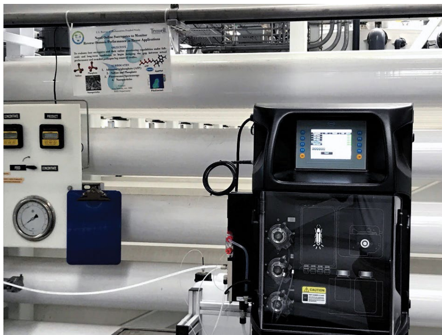
EZ7300 ATP Analyser installed

This study demonstrated that Adenosine Triphosphate (ATP) is continuously present in treated wastewater, as a naturally occurring compound of biological origin. It is present in high concentration in the RO feed and in measurable concentrations in RO permeate; this combined with its high removal by RO makes free ATP an excellent candidate for LRV demonstration. Free ATP concentrations in the RO feed and permeate can be successfully and continuously monitored by the EZ7300 online analyser.