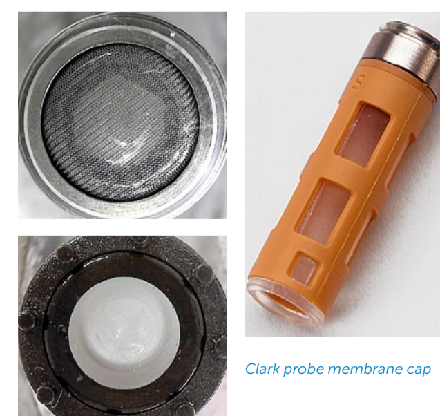
Clark probe membrane cap