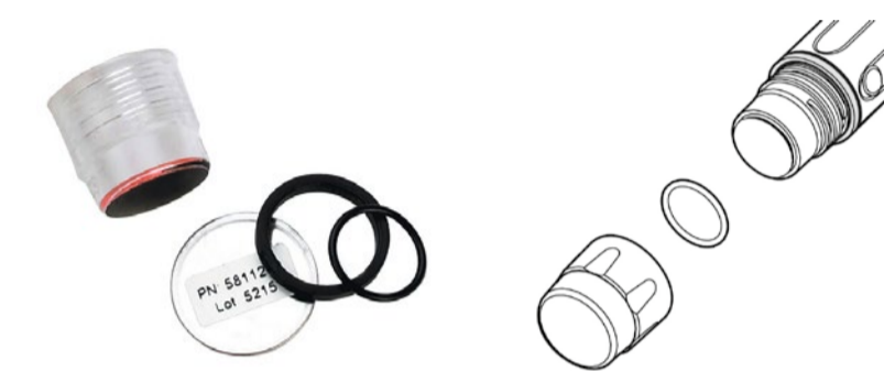
Assembling o-rings and LDO sensor cap