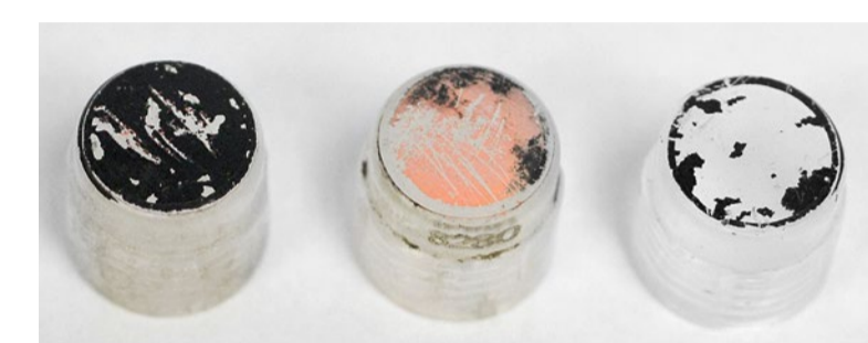
Used/damaged LDO caps

Based on the use model, the cleaning and maintenance frequency, the LDO sensor cap must be replaced after 365 days. After one year of exposure to wastewater, cold and abrasive samples, the normal performance of the LDO sensor cap can no longer be guaranteed. To ensure optimal performance we recommend a change of the sensor cap for the optical oxygen sensor at least every year. With the new cap, replace also the "i-button", which contains the calibration data.