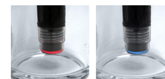
Red and blue flashing LDO probe in a BOD bottle during calibration.