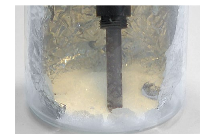
Contaminated silver electrodes can be cleaned using aluminium foil, salt (NaCl) and hot water.

Insert the Clark probe (silver electrode) in a glass beaker, with an aluminium foil inside (like a tube), the bottom covered with NaCl. Fill with hot tap water (<70 °C) and wait for 10 minutes. Rinse the probe with de-ionised water and wipe the silver electrode clean with a soft cloth. Assemble the Clark probe and polarise over night. Then calibrate with 0% and 100% oxygen standard.