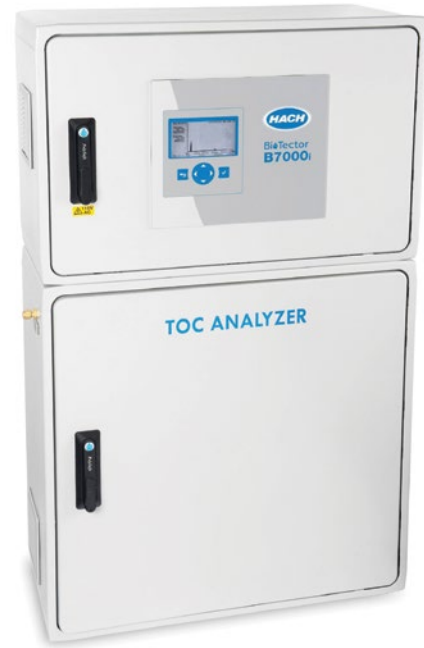
Hach BioTector B7000i

In addition, the well-proven and powerful TSAO TOC technology allows the analysis of large sample volumes of up to 8-10 mL, which typically is a 1,000 times bigger sample volume when compared with conventional TOC technologies, thus achieving a much more representative measurement.