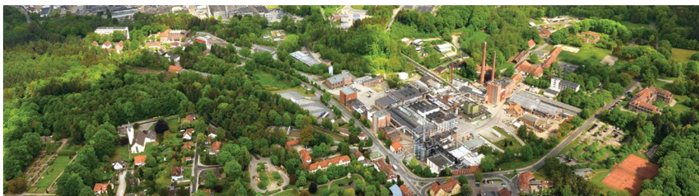
Industrial Park Walsrode

The Bomlitz site now benefits from maximum availability, alongside minimal service and maintenance interventions. In Dow's evaluation, BioTector attained the best: laboratory conformance for TOC and TN; combined monitoring on TOC, TIC, and TN; and guaranteed complete TIC removal prior to TOC and TN measurement.