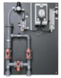
Sample Preconditioning Panel