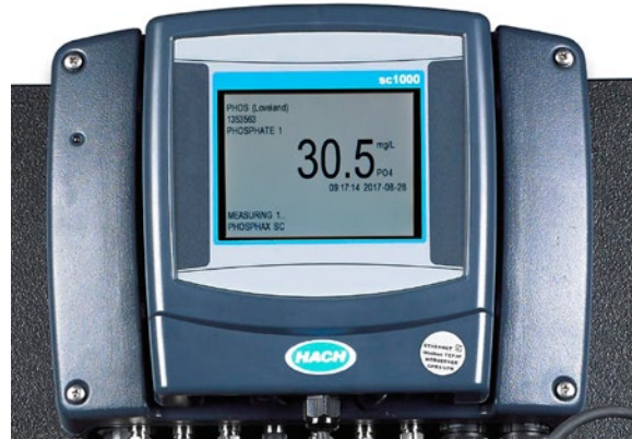
Figure 4: Example Phosphax real-time data