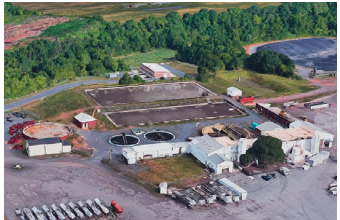
Figure 1: The JBS WWTP Plant empties directly into the Skippack Creek, which ultimately feeds the Delaware River.

The plant discharges directly to the Skippack Creek, which ultimately feeds the Delaware River, and is upstream from Evansburg State Park which features public fishing and picnic areas near the water. TP levels, especially during the Summer months when compliance limits are more stringent, were difficult to keep under the allowed threshold. The customer required a solution that minimized the potential for higher TP remaining in the final effluent and ensured water quality to the neighboring natural environment.