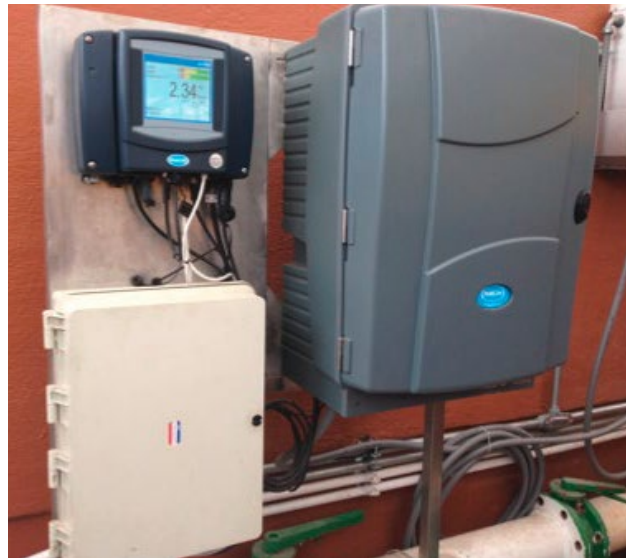
Figure 3: Example RTC-P system

The customer receives onsite and remote support from Hach specialists assisting with installation and ongoing monitoring through the RTC Helpdesk, keeping operations running smoothly. The Phosphax™ tests the water every 5 - 7 minutes and provides the RTC-P controller with up to 288 data points per day, which then adjusts the chemical dose in real-time to handle spikes in phosphate levels or reduce dosage during overfeed situations. Hach also paired the RTC-P with its Prognosys™ predictive diagnostic system to ensure compliance by preventing unexpected instrumentation emergencies. If phosphate levels exceed set limits, the helpdesk and plant operators are notified via text message immediately so they can address any issues with chemistry or equipment. The RTC-P system allows the WWTP to manage phosphorus removal with confidence.