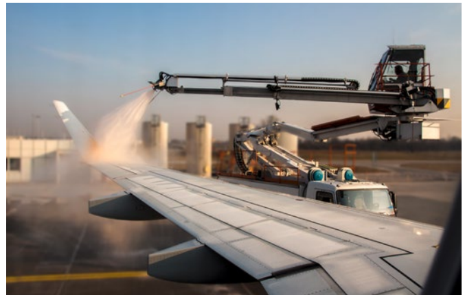
De-icing of an airplane

Monitoring of stormwater runoff and surface water effluent at airports presents several challenges. Drainage systems are typically located many feet below the surface. Seasonal water levels and contaminant can vary significantly, as can contaminant content, especially during winter when de-icing and anti-icing agents are used.