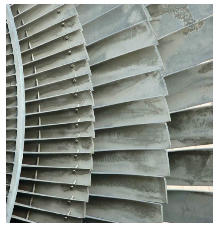
Silica deposition on turbine blades is a critical issue

The goal of the blowdown process is to remove the water from the boiler which removes several impurities like precipitated sludge and dissolved solids. To control blowdown properly, continuous monitoring of control parameters, such as silica, is needed to indicate the effectiveness of the water chemistry programme in the boiler. It also reduces large swings in boiler chemistries. In some cases, levels can go up to several thousand ppb of SiO<sub>2</sub>.