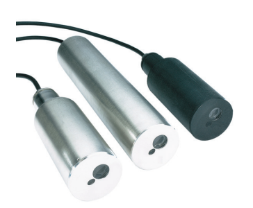
Solitax sc Sensors