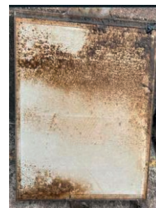
Picture 6: FX620 membrane after 16 weeks with no mechanical cleaning in final effluent