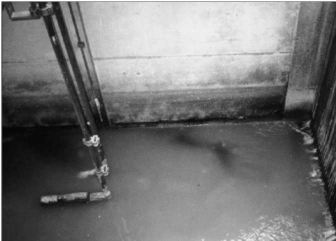
Figure 2 – A Hach UVAS sc Sensor and SOLITAX sc TS-line Sensor monitor a rain overflow basin, providing operators with real-time loading information.

Figure 2 shows installation of the UVAS sc Sensor at a rain overflow basin. An accompanying Hach SOLITAX™ sc Turbidity and Suspended Solids Sensor monitors concentration of undissolved contaminants. Both sensor signals can be sent to, and displayed by, the same Hach sc Controller.