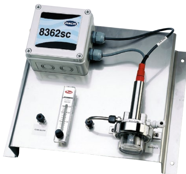
Figure 1 – 8362 sc pH Panel

Initial and ongoing calibration of pH electrodes is essential for obtaining accurate measurements. Calibrations are performed with buffer solutions prepared at known concentrations. These buffers have a much higher ionic strength than high purity steam cycle water. This significant difference in strength makes calibration of a low ionic strength electrode time consuming. The electrode must equilibrate with the high ionic strength buffers for the calibration, and then re equilibrate with the low ionic strength process water. ASTM D5128 recommends 3 to 4 hours of re equilibration after exposing the electrode to the calibration buffer. While this delay is unavoidable during initial calibration, much quicker ongoing calibrations may be performed with grab samples following ASTM D5464.