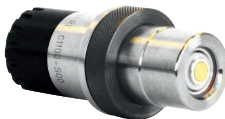
C1100 Ozone Sensor