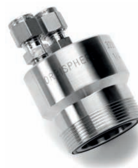
Orbisphere Flow Chamber (32001)