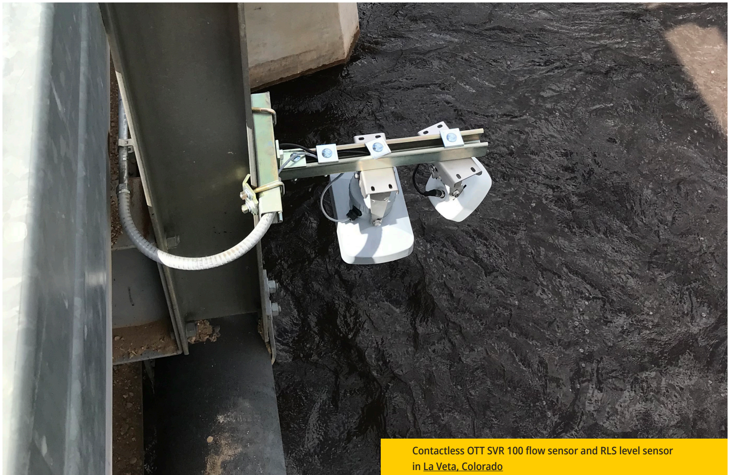
Contactless OTT SVR 100 flow sensor and RLS level sensor in La Veta, Colorado