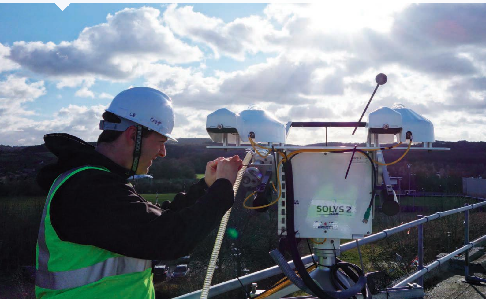
AirShield DNI installed and almost ready to operate

For more information on the group's research go to: www.lboro.ac.uk/crest ■