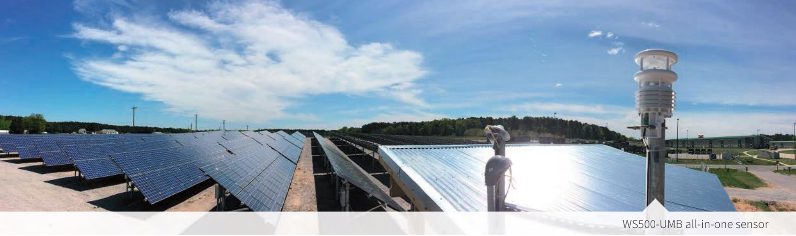
WS500-UMB all-in-one sensor