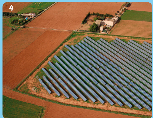
1. Project PEGASE of CNRS-PROMES in the Pyrenees of France. 2. Solar thermal collector testing site of the University of Jyväskylä Renewable Energy Research and Education Program. 3. and 4. Solar farms in Palma de Mallorca. Owner: AFFIRMA. Engineered and installed by ELECINOR