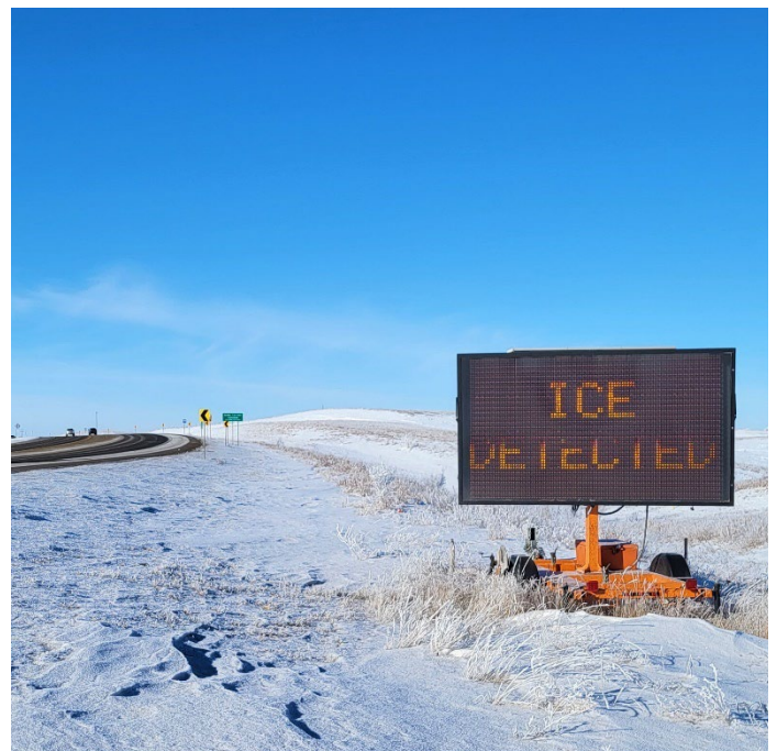
Weather threshold-controlled sign notifying drivers of dangerous road conditions in North Dakota, USA.